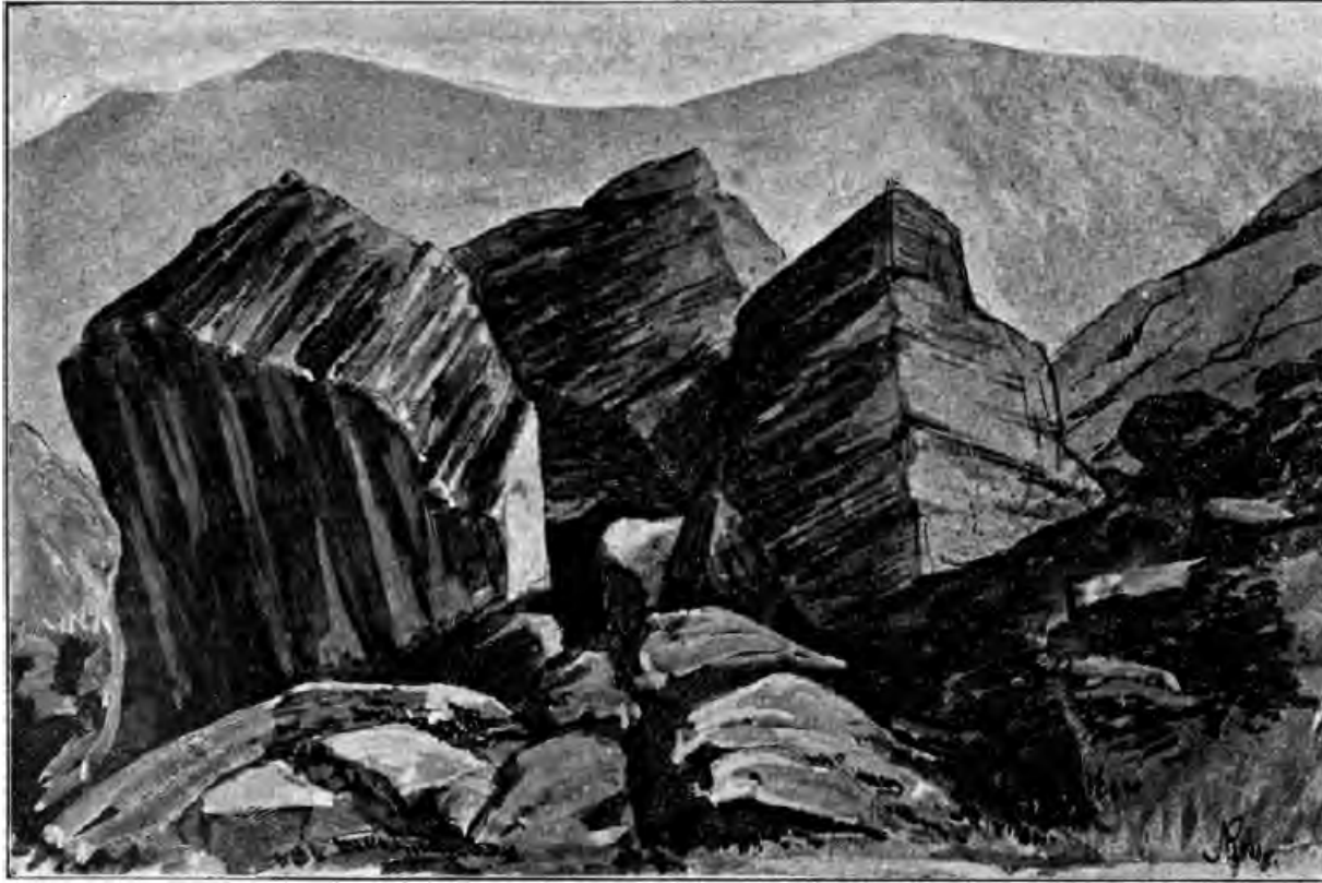
THE CAVE IN GLENMORISTON VIEW OF OPENING LOOKING DOWN THE GLEN