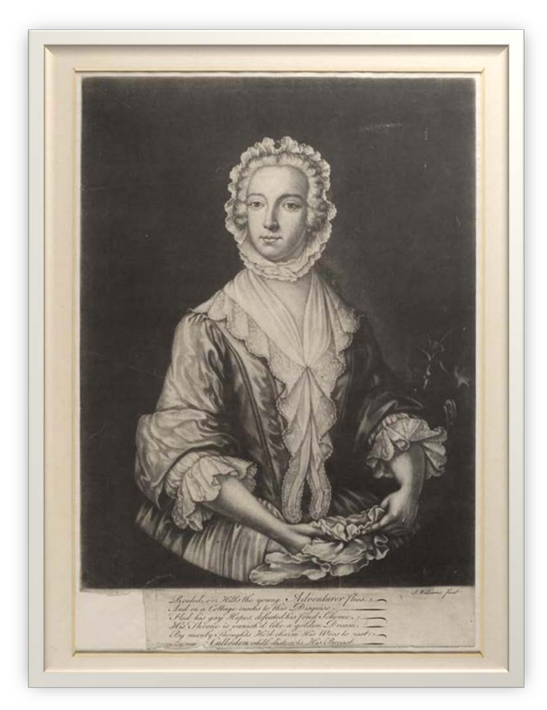
Prince Charles disguised as Betty Burke (National Galleries of Scotland)