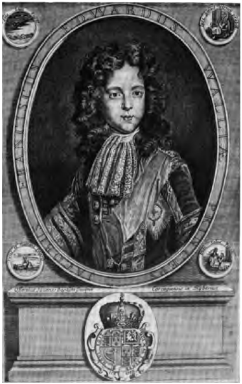
THE CHEVALIER DE ST. GEORGES WHEN PRINCE OF WALES.

The general elections, happening to combine with St. George's day, were the prelude to a general rising. On that day, out of compliment to the Chevalier, crowds thronged the streets; King William was burnt in effigy; cries of "Ormonde!" "Bolingbroke!"